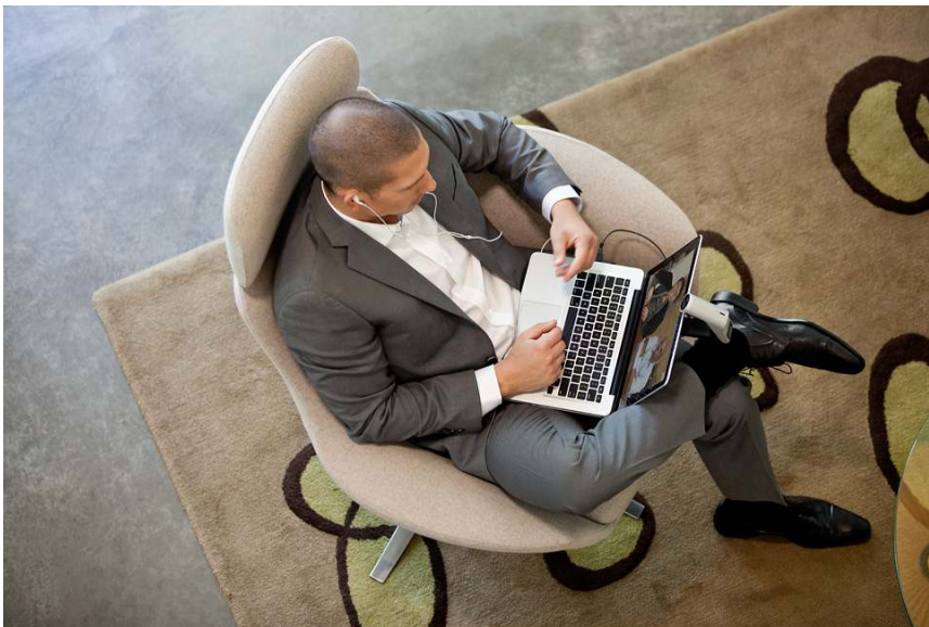
Figure 1. Cisco Jabber Video for TelePresence

The Cisco TelePresence® portfolio creates an immersive, face-to-face experience over the network - empowering you to collaborate with others like never before. Through a powerful combination of technologies and design that allows you and remote participants to feel as if you are all in the same room, the Cisco TelePresence portfolio has the potential to provide great productivity benefits and transform your business. Many organizations are already using it to control costs, make decisions faster, improve customer intimacy, scale scarce resources, and speed products to market.