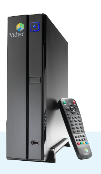
VidyoRoom HD-100 delivers outstanding performance for a fraction of the cost of traditional room systems.