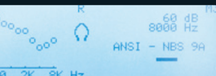
Manual Audiogram result.