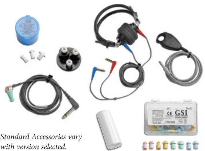
Standard Accessories vary with version selected.