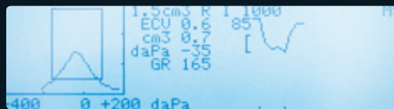
Sample 226 Hz Tymp and 1000 Hz Ipsi Reflex result.